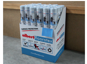
available in retail boxes